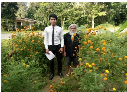
Figure4. To make drugs