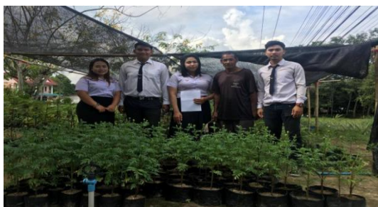
Figure1.Direct commercial value

The use of marigold in the community(Figure 1-6):