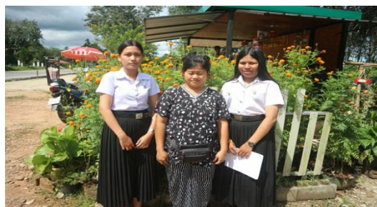
Figure2.Decoration and beautification, grown in gardens for photography