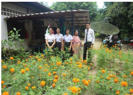
Figure3. Make garlands for monks