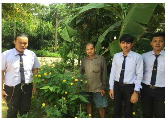
Figure5. Insect and pest repellent