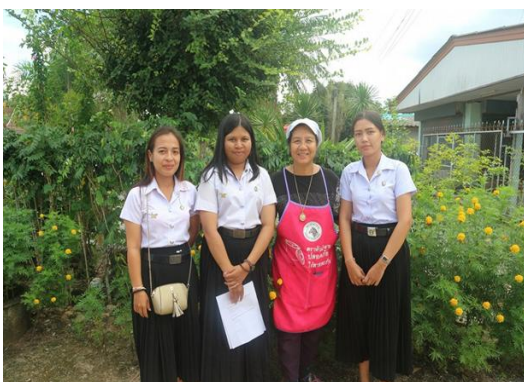
Figure6. Decoration and beautification

From this study, the list of the uses of marigold can be classified based on the number of families recorded performing them. Up to 16 families used marigolds for decorations and in various ceremonies. Nine families used them as insect repellents, eight families for cooking, six families for tourism, five families for feeding animals, and two families for medicine. Finally, marigold was used in dyeing and was commercially distributed (selling) by only one family each. The results have been summarized in Figure 7.