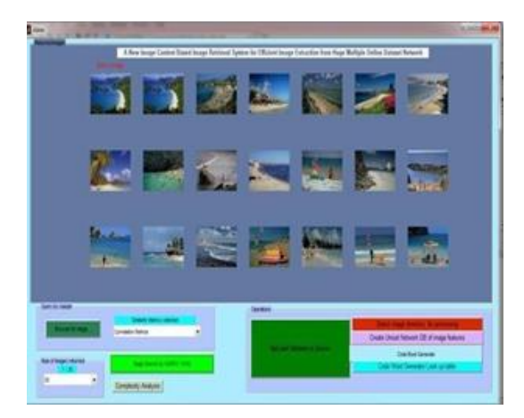
Figure2: Retrieving similar type of images from the given input query image

The figure2 describes that for example beach image is given as an input query image .the output image obtained is that the similar type of the beach input images.