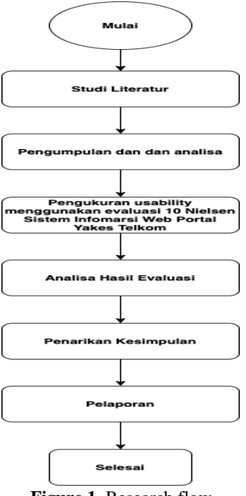
Figure 1. Research flow

Starting with a literature study to obtain the required data and references, followed by data collection and analysis to provide an overview of the assessment and selection of the method used. Furthermore, the measurement of the Yakes Telkom website uses the Nielsen ten heuristic evaluation method by distributing questionnaires, then calculating and recapitulating the average test score results on the Telkom health foundation website and ending with drawing conclusions.