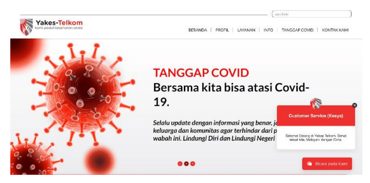
Figure 2. Screenshot of the home page of the Telkom health foundation website

The appearance of the Telkom health foundation website that will be evaluated is in Figure 2-4.