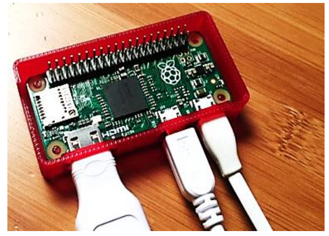
Figure.2 Assembled Components for installation

The components required for the connections are: HDMI cable, Wireless mouse and keyboard, SD card of memory 32GB and Charger cable. The keyboard and mouse are related to the provided ports of the Raspberry Pi.SD card is connected on the back side of the pi. Connect the desktop and Raspberry Pi using the HDMI cable shown in Fig.2.