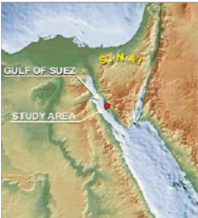
Figure (1) GOS fields map