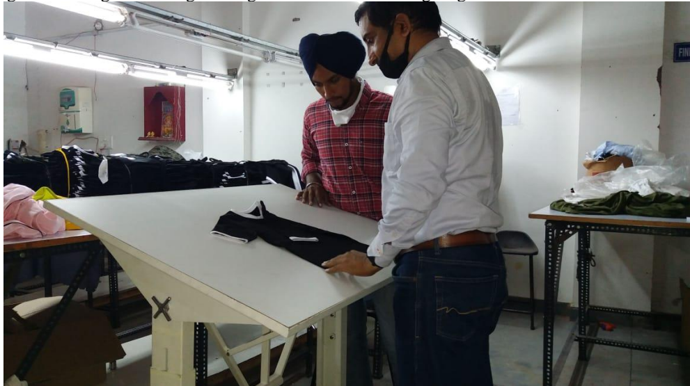
Picture 3: Demonstrating Finishing stage of Garment Folding using Prototype of table. The slope of the table has been adjusted to 30 degree angle. Here hand movements are smooth as ease of operation with both hands is possible. There is smooth movement with least stress and tension of arm, wrist and hand muscles.

The modifications proved to be feasible and there was no evidence found to record any form of deterioration in quality of work being done during the folding of the garments at the finishing stage.