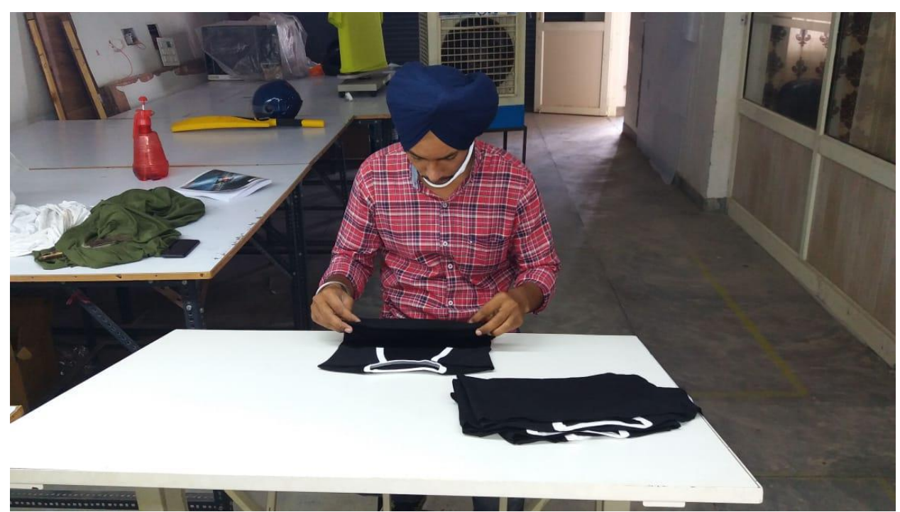
Picture 6: Prototype table inclined at 30 degree improved efficiency as workers could sit and and there was lesser tension observed in the shoulders and arms. When times through three work cycles the efficiency of folding garments of the same worker was seen to increase by 22 per cent (based on number of garments folded I the same time at 0^{0} and 30^{0} angles)