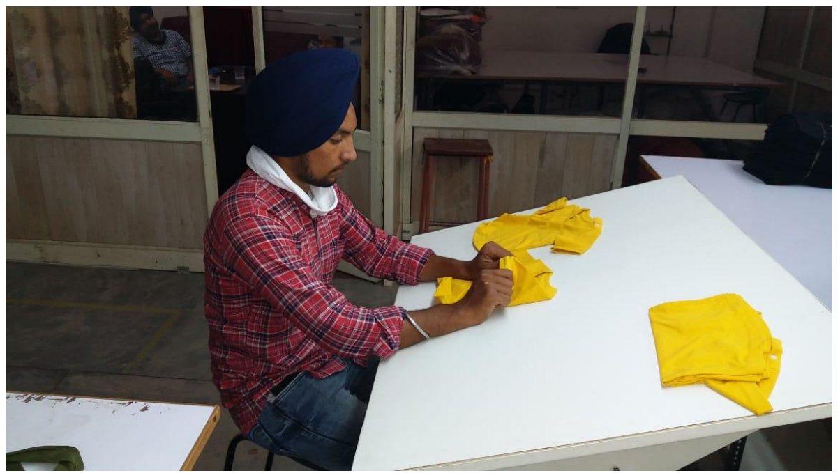
Picture 1: Elbow, arm, wrist (relaxation observed at 30 degrees slope angle of the Prototype Table for Folding at finishing stage of garment manufacturing assembly line

Once a table had been designed as a work aid there was the task of taking requisite observations and measurements of the workers postures when they were working at the redesigned table under various conditions of table inclination as also the workers seated and standing position.