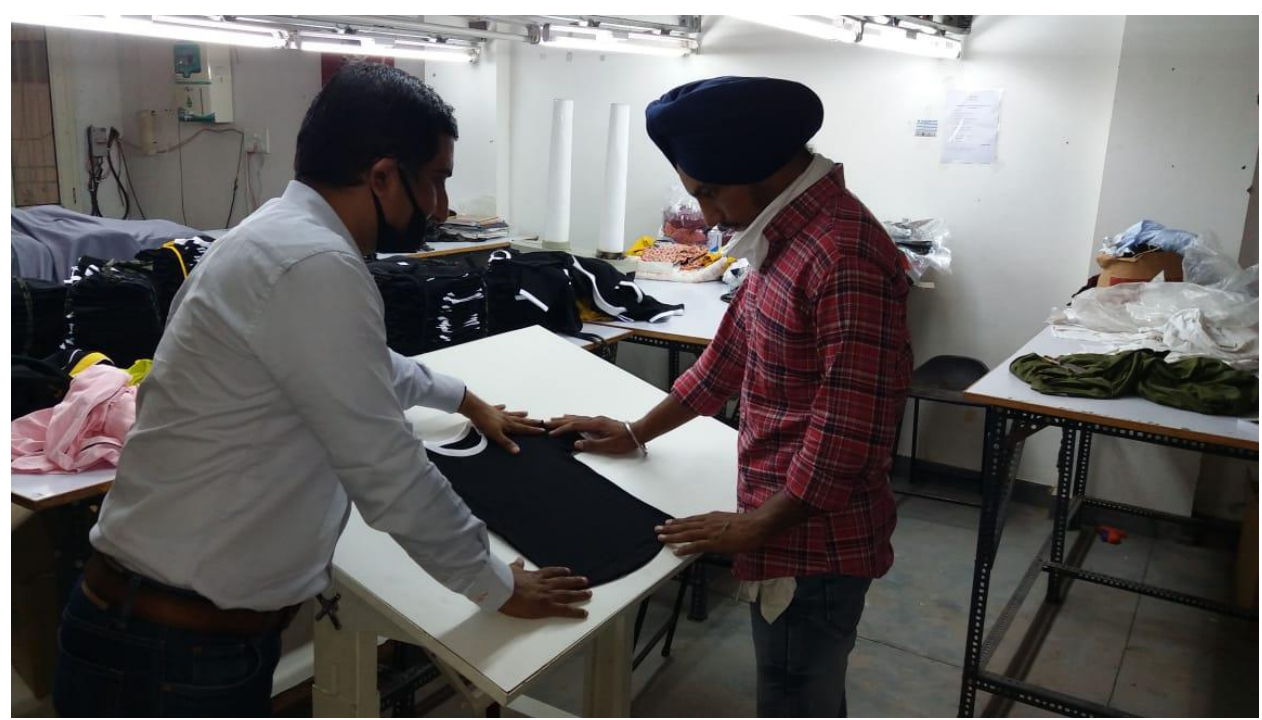
Picture 7: Demonstrating Finishing Stage Using Prototype of table for folding garments. Table slope at 45 degree angle. Worker facilitated for garment folding while standing up. Shoulder tension negligible as muscles are comparatively relaxed.

An average count conducted over here work cycles indicated the varying position and posture of the worker were taken into consideration during the performance of all movements related to the task of folding garments at the finishing end of the garment manufacturing assembly line.