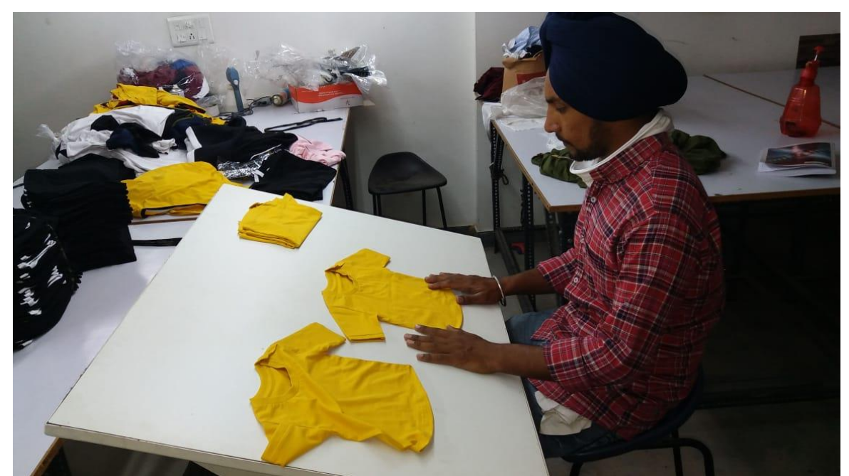
Picture 2: Shoulders, trunk tension observed to be eased in the worker seated at 30 degrees inclined Prototype table for folding. The seated posture of the worker was video graphed through three work cycles. Personal comments of the workers reported "better comfort level" through the task as compared to earlier tables".

The modifications proved to be feasible and there was no evidence found to record any form of deterioration in quality of work being done during the folding of the garments at the finishing stage.