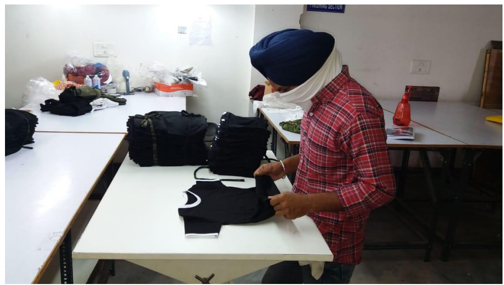
Picture 5: Comparison of Efficiency Increase with Prototype table for folding at flat position (0 degrees) and the muscular tension noted

The researcher used three simultaneously recording camera's for capturing the postures of workers while he or she went through the everyday work of folding the clothes. The cameras were focused on providing views that would enable an analysis to be attempted of the head, neck and trunk as well as shoulder flexion, besides repeat actions of both right and left arms.