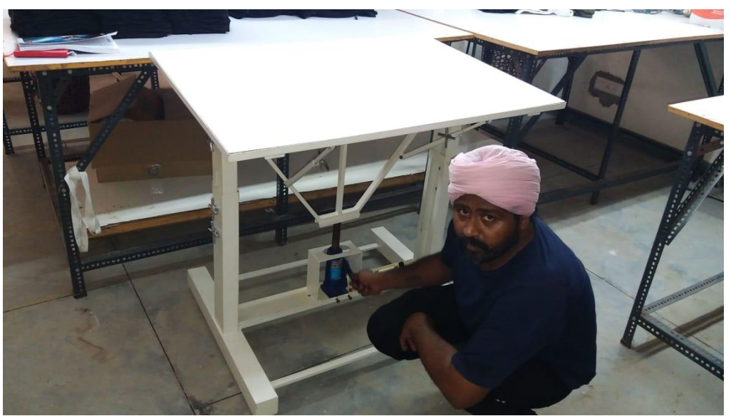
Picture 4: Technical management of table height and slope through adjustment controls that can be set to comfort level of the worker. The slope operations are flexible from 0 to 45 degree.

work surfaces can be useful in improving posture during some of the assembly line specific work tasks" in various sections of the garment manufacturing industry.