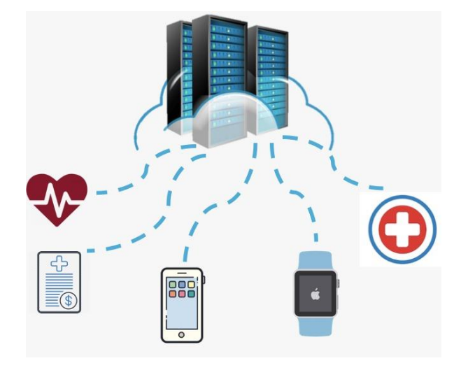
Figure 2. cloud computing and smart health [20].