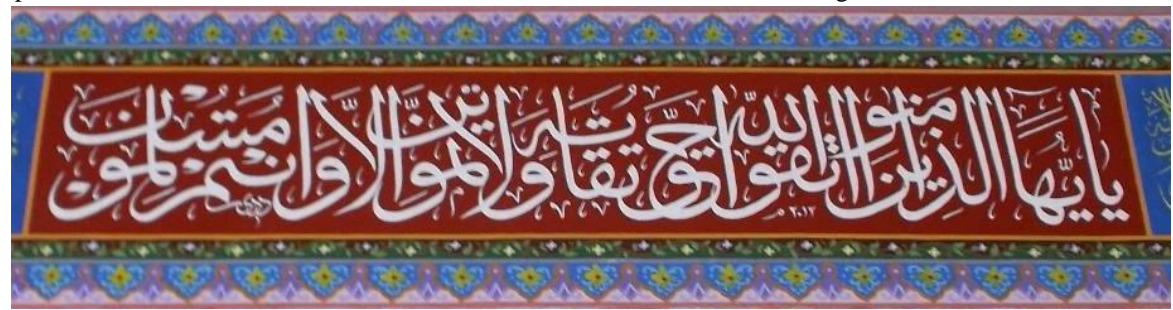
Figure 1. Tsulust-style calligraphy on wall media (graffiti)

From samples of Central Javanese calligraphy expressions, the dominant type or style used in calligraphy expressions is Tutsulusiy . There are 39 or 55.71% of the writing in tsulust style. The characteristic of khat tsulust shows flexibility which makes it easy for the letters to be lengthened or shortened to fit into the existing space or shape. Lined lines and extended vertical lines are standard features of this writing.