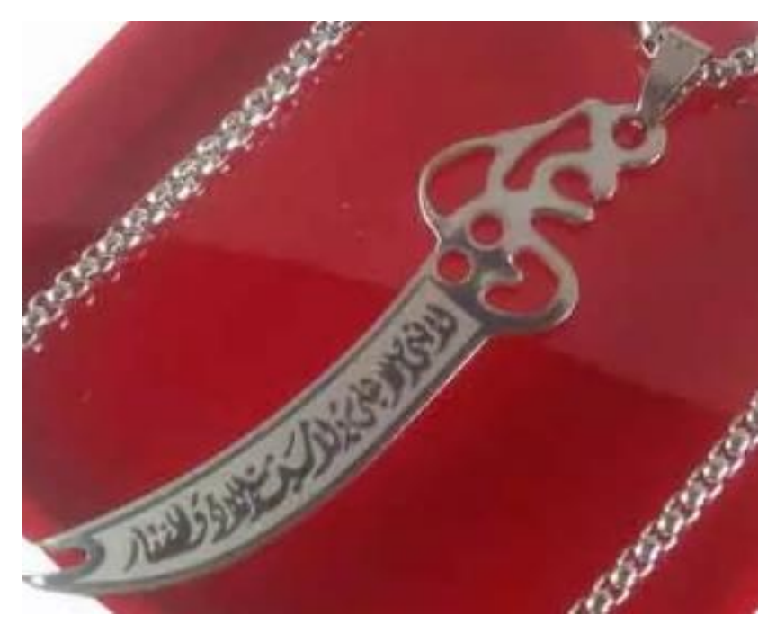
Figure 4. Diwaniy-style calligraphy on mini sword-shaped accessories

Another style that is rarely used as a form of calligraphy expression in the Central Java region is diwaniy. There are two or 2.85% diwaniy style writing. Khat diwa> niy is a form of Arabic calligraphy that also accentuates an aesthetic element by displaying curved lines. The characteristic of khat in <wa> niy is flexible arches, the posture is tilted to the left in layers with decorative patterns that show its beauty. Another feature is that the round writing is recognizable by its excessive flowing movements and the gradual elevation and lengthening of the letters at the end of the line.