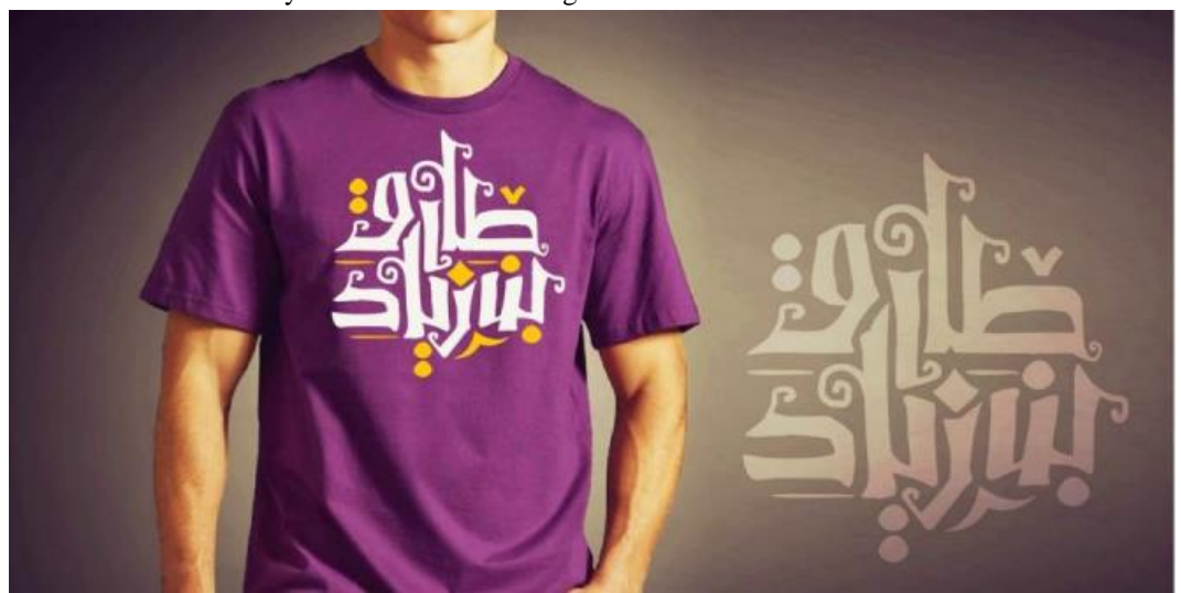
Figure 8. Pure abstraction calligraphy or fake calligraphy on t-shirt media

In addition, there are also 6 or 8.57% calligraphy expressions of pure abstraction type or fake calligraphy that cannot be read because they are a series of meaningless letters.