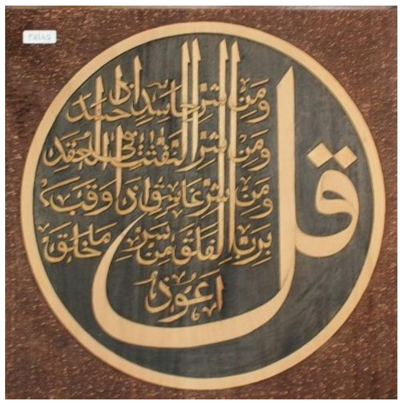
Figure 7. Expressionist calligraphy letter al Falaq on wood media

In addition, there are also 6 or 8.57% calligraphy expressions of pure abstraction type or fake calligraphy that cannot be read because they are a series of meaningless letters.