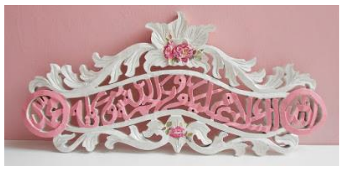
Figure 2. Naskhi-style calligraphy on stone media

Another type or style of calligraphy that is commonly found is naskhiy . There are 17 or 42.50% naskhiy style writing. Khat naskh is a form of Arabic calligraphy that resembles khat tsuluts , it's just that the shape is simpler or not as complicated as khat tsulust . Khat naskh is generally used according to the name naskh or manuscript, namely writing texts or books. The main characteristic of khat naskh is a cursive form, which is a circular motion. Apart from that it is characterized by its clarity, simplicity, and ease of reading.