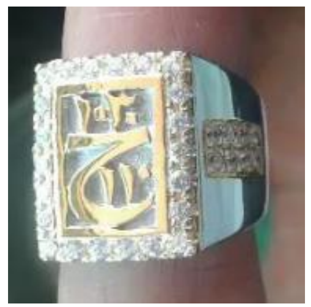
Figure 9. Symbolic calligraphy in the form of numbers (1030 above, 110 below) and letters ( \tau ) on the media for ring accessories.