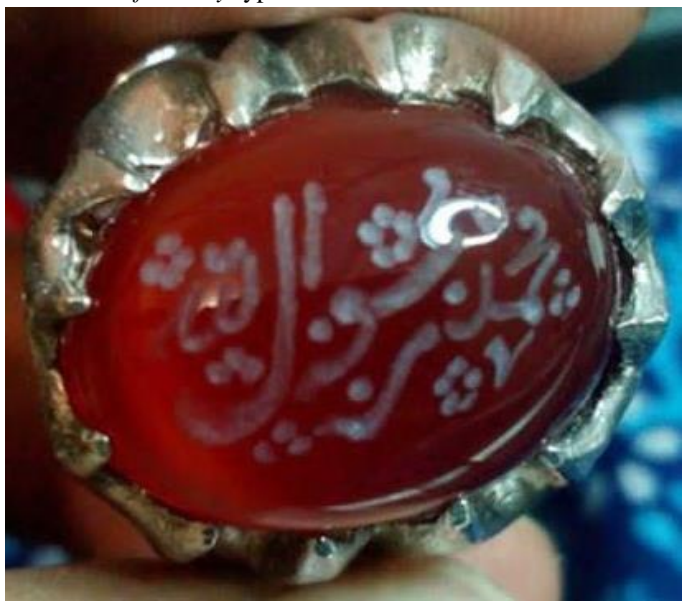
Figure 3. Calligraphy in physical style on agate media

is not the same as conspicuously, so it takes more than one pen in writing. Besides that, it has a distinctive characteristic is the number of letters that have a flowing horizontal curve and are too extended. Filling in small circles, very fragile and sharp edges of letters, emphasis on flat rather than vertical strokes, and contrasting the lines' width are also other characteristics of fa> risiy typeface.