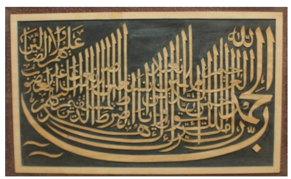
Figure 6. Figural calligraphy of the al Fatihah letter ship on wood media

This type of traditional expression is a type of calligraphy art expression widely used by the people of Central Java. From the existing sample, there are 25 or 35.71% types of traditional calligraphy expressions. Traditional calligraphy is an example of a category that shows harmony with long-established habits and more standard elements in the Islamic tradition. Another type of expression that is just as widely used after traditional expressions is figural calligraphy expression. There are 25 or 35.71% types of figural calligraphy used by the people of Central Java. In figural calligraphy design, letters can be extended and shortened, stretched and pressed, or made transparently. This is done by lengthening, twisting, and looping or adding or filling, bringing them into harmony with the shapes of no calligraphic, geometric, plant, animal (zoomorphic), or human figures.