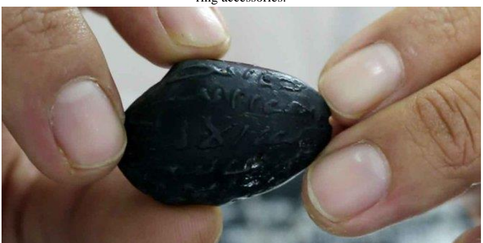
Figure 10. Symbolic calligraphy in the form of three letters (1) and (12) on stone media