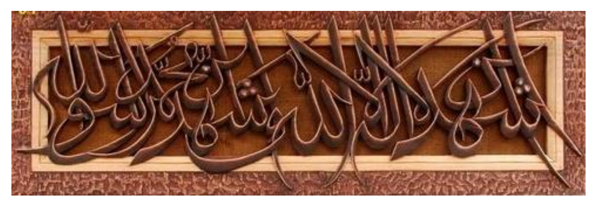
Figure 5. Contemporary non-standard calligraphy, the development of tustust style on wood media

Apart from these styles, there are mixed styles that try to combine several types of calligraphy, such as (1) a combination of diwaniy and naskhiy styles in the expression (الله محمد); (2) a combination of diwaniy, tsulust, and naskhiy styles in the expression (الداء والدواء); (3) a combination of diwaniy and tsulust styles in the expression (الله) a combination of diwaniy and tsulust styles in the expression (الله). Three forms of writing do not follow specific rules or styles so that their writing styles cannot be grouped. However, there are non-standard forms that are the development of standard formats to appear as contemporary forms, such as the three forms of development of the tsulust style.