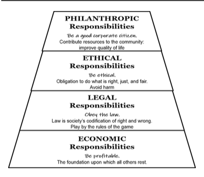
Fig. 1 The social responsibility of the corporation T and the model[11]