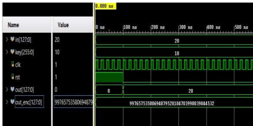
Figure 4. Proposed Simulation Output