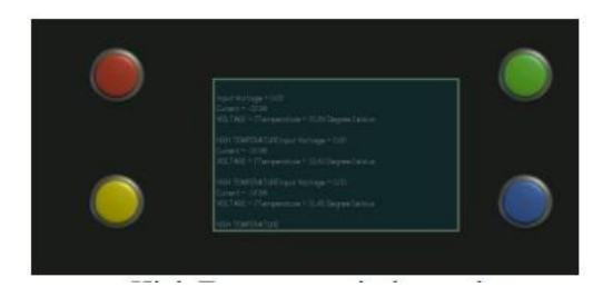
High Temperature is detected

The fault diagnosis feature, which can identify any battery pack defects and allow the driver to take the appropriate action, is also crucial. This function makes sure that any battery pack problems are swiftly found and fixed, minimising downtime and enhancing the overall dependability of the electric vehicle.