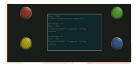
Flame is detected