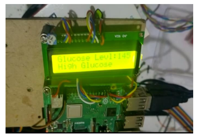
Fig. 3: Result displayed on LCD display.