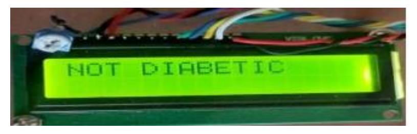
Fig. 4: Result displayed as not diabetic.