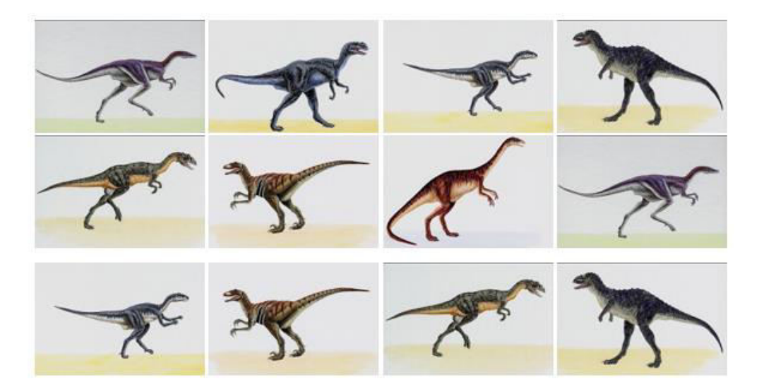
Figure 5. Dinosaur as a query and top 12 retrieved images from database