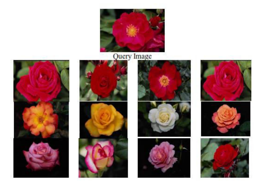
Figure 3. Flower as a query and the top 12 retrieved images from database